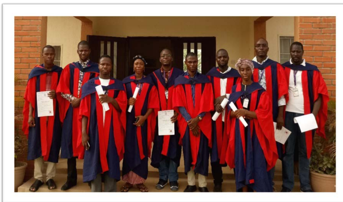
Figure 2.3 Batch C (Set of 2018) graduates displaying their Statement of Results