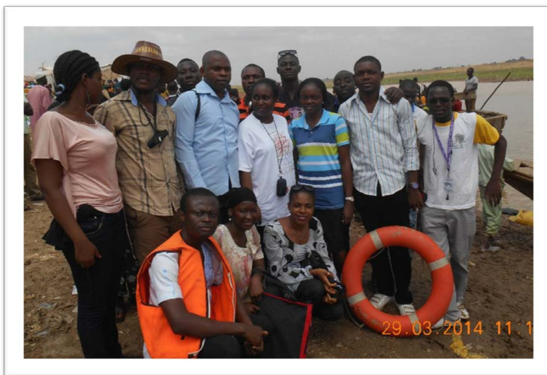
Figure 2.4: Some WASCAL CC and ALU Staff with Batch B graduates on the Shiroro Dam during their educational visit to the dam

Regarding extracurricular activities, outside the usual busy academic events, the students embarked on an educational visit to locations in Nigeria outside the normal learning environment. Some Batch A students took a tour to some tourist locations (Ikogosi Warm Stream, Idanre Hill, Osun Grove, and Erin Ijesha Falls) in South-West Nigeria. Figure 2.4 shows Batch B students upstream of Shiroro Dam during their educational visit to the dam. Batch C graduates also visited the Dam. Figure 2.5 shows Batch C students upstream of Shiroro Dam.