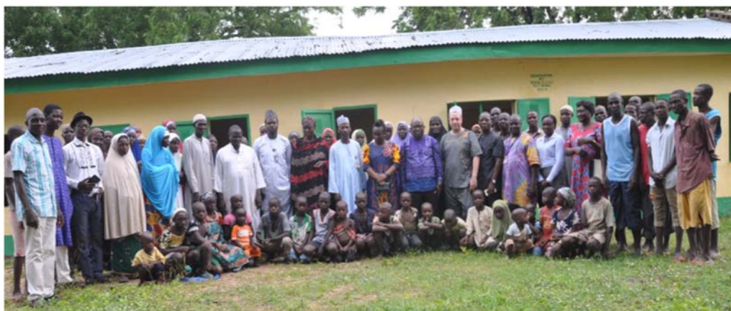
Figure 3.4 Members of the International Advisory Board, Staff of WASCAL and Busugi Primary School staff and pupils, their parents and other members of the community at the commissioning.