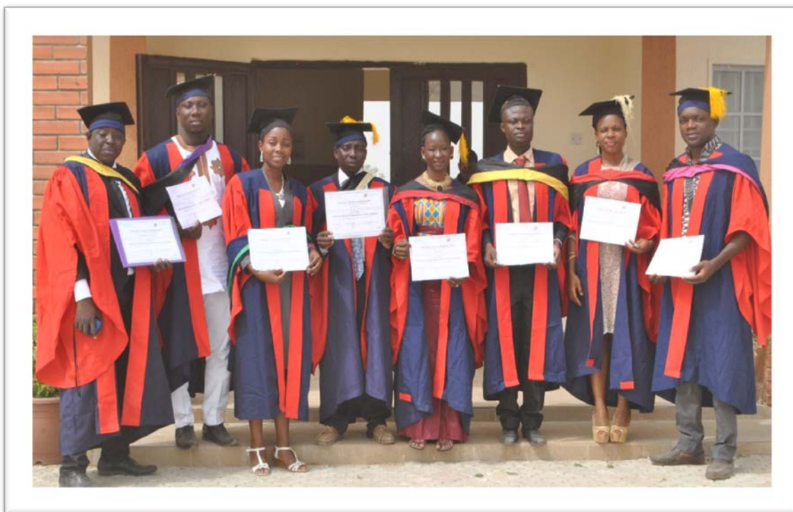
Figure 2.2 Batch “B” (Set of 2016) graduates displaying their certificates